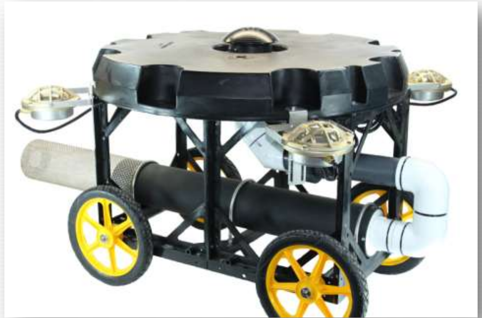
(Shown with Optional Wheel and Light Kit)