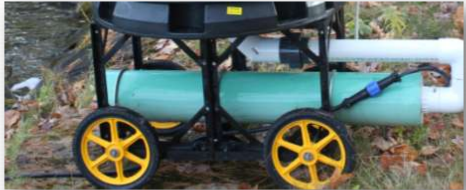
(Shown with Optional Wheel Kit)