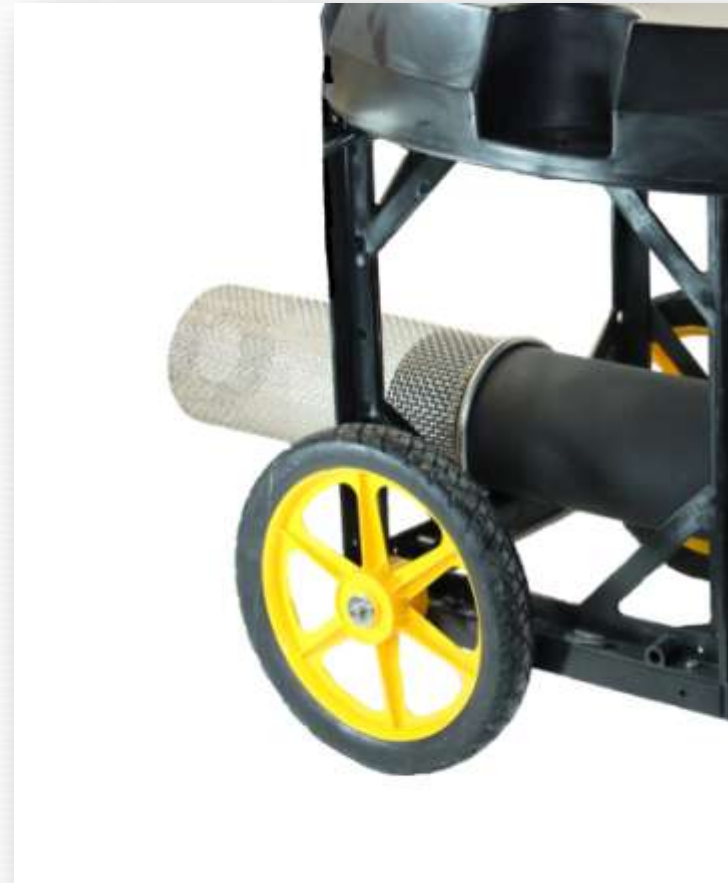
(Shown with Optional Wheel Kit)