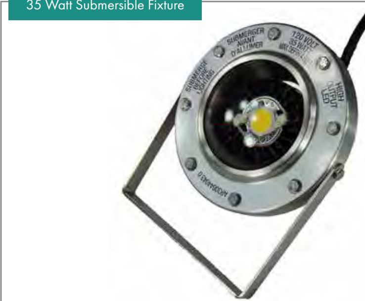
35 Watt Submersible Fixture